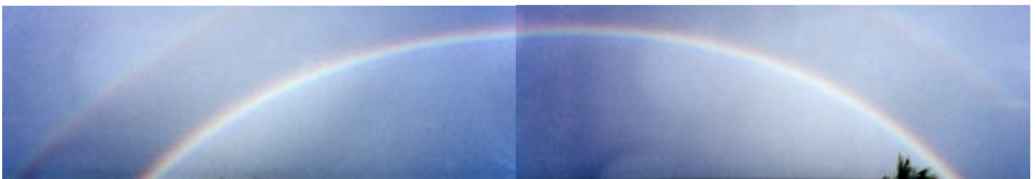
Sunday afternoon a fantastic double rainbow appeared over the Atlantic just after the fleet of Tall Ships sailed north to New York Harbor for the 4th of July celebration

So, what's the magic of the mermaids? Your investigative reporter get's 'the rest of the story'