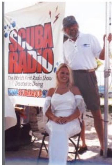
Jean-Michel Cousteau and 'the mermaid'