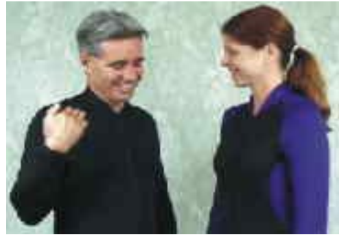
Practicing signing "Wow!"