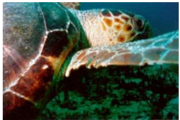
Last Year's Photo Contest: First Place Novice

Cost: $100; Deposit: $50, due by April 15 th Contact: Bill Paskert (407) 678-5311 (H), (407) 356-2290 (W)