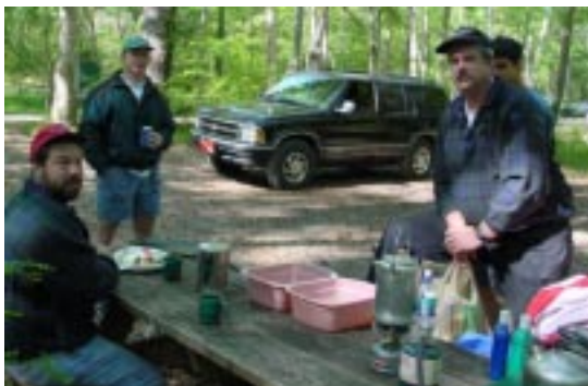
They really don't shop together!