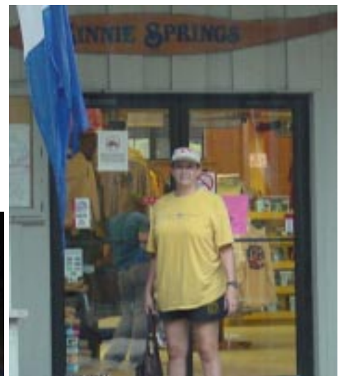
Okay, it's not REAL camping unless it rains!

Ed. Note: Thanks to Gwen and Ralph Rolape for these photos and captions