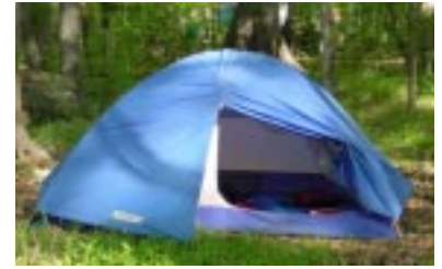
Dean's bachelor pad