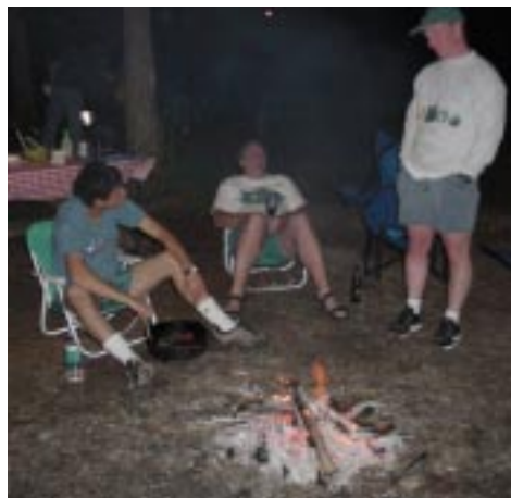
Nothing like a nice campfire!