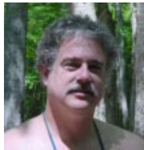
The Before Shot!