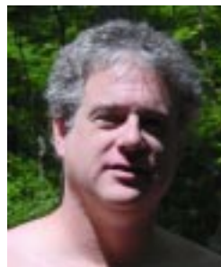
The After Shot! NO MORE LEAKING MASK! (Clue: check out the moustache)