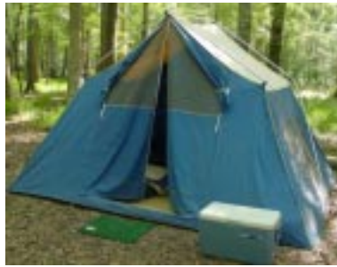
The Rolape's Chalet