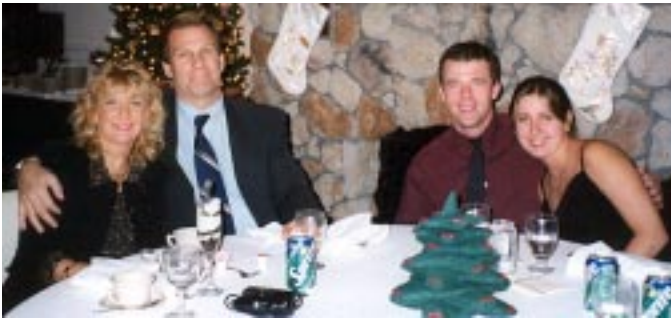
A good time was had by all . . .