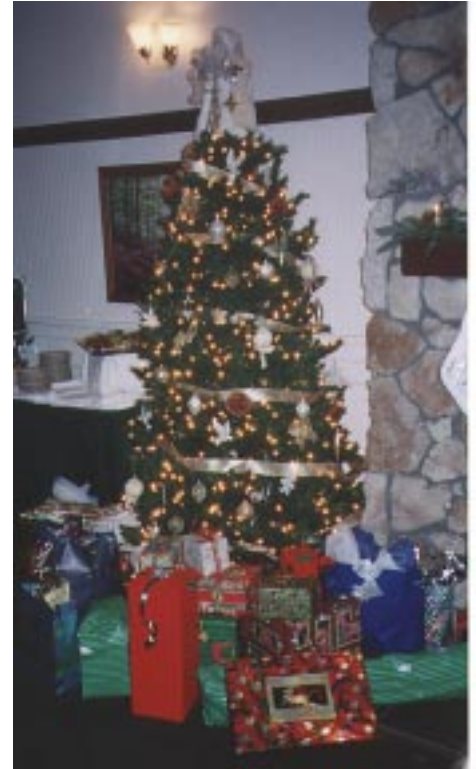
Holiday Spirit runneth over

This year there were a lot of great FISH gifts. Every time a new gift was opened, everybody in the group had their eye on it. Gifts were going back and forth across the room. A majority of us got the gift we wanted. At the end of the night, we finally called the last number and ended the holiday party with a bang. But while people were leaving the party, I noticed people were still gift exchanging.