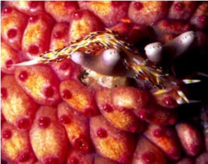
Rainbow nudibranch on red bubble coral; Fiji