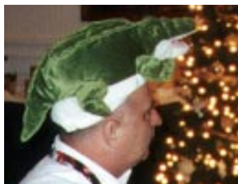
Gator on Gator