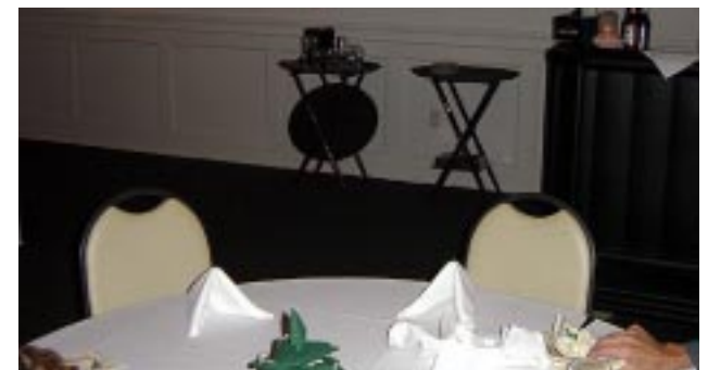
We missed Gwen & Ralph