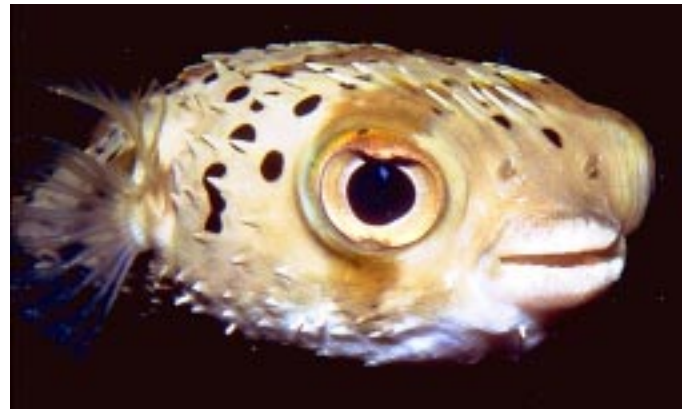
Brown, black, and white balloonfish (Didon holcanthus); Cayman Islands