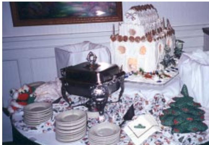
Some beautiful desserts