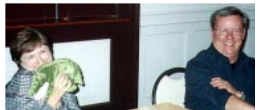
But mama gator took him home!