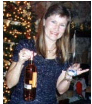
Patsy's got a keeper!