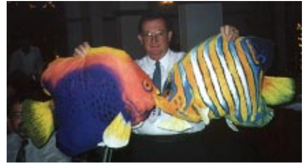
George and more fish