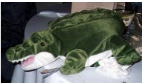
Would you believe it's a hat?